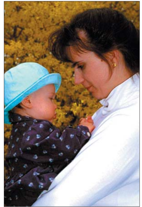
Young children are most likely to experience healthy social and emotional development in a responsive home environment with lots of opportunities to interact successfully with interesting people and things.